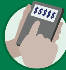
clean-up and repairs that cost homeowners and businesses a lot of money