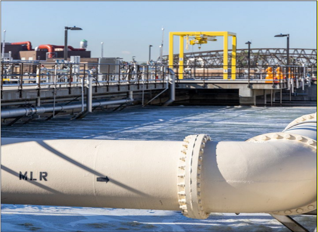
Northern Treatment Plant Bioreactor, taken in 2023.