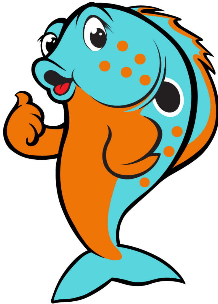
Metro's education mascot "Fin" – an orange-spotted sunfish