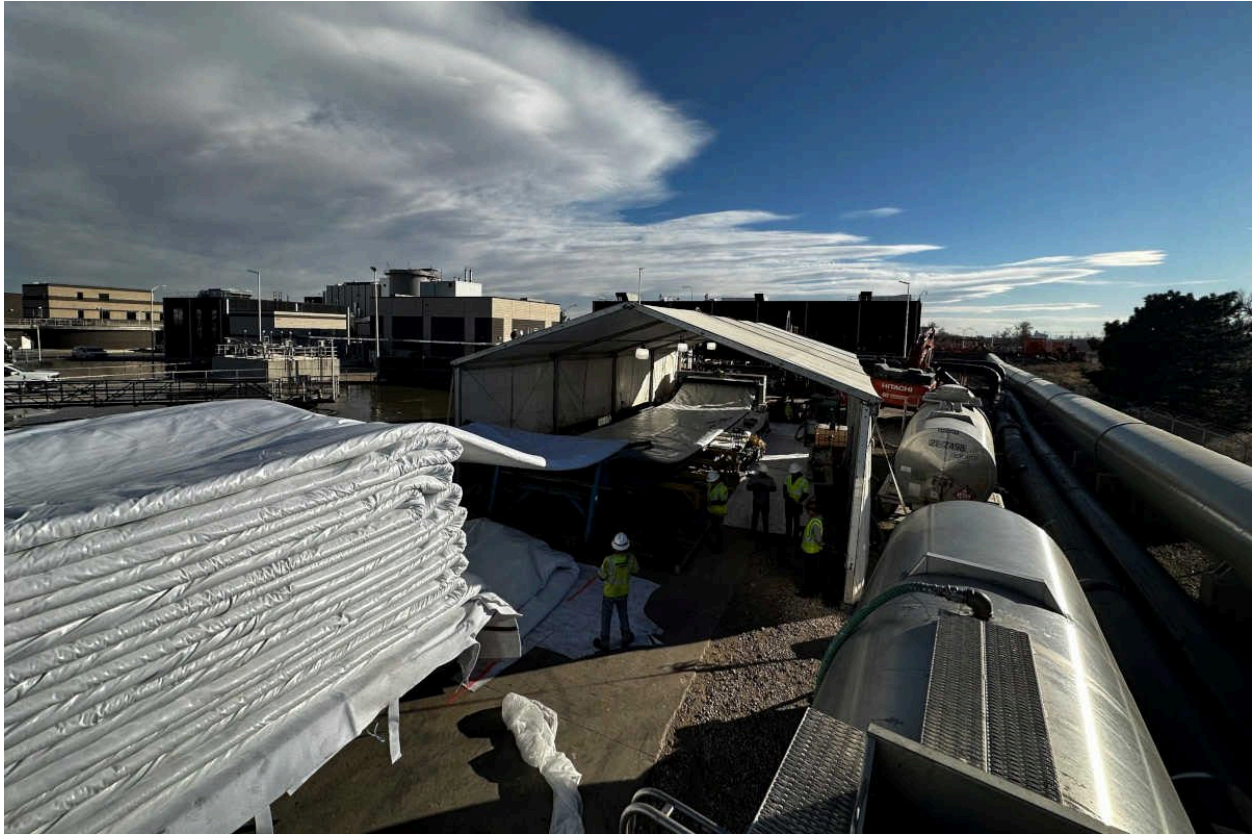
Robert W. Hite Treatment Facility in 2023. Trenchless technology.