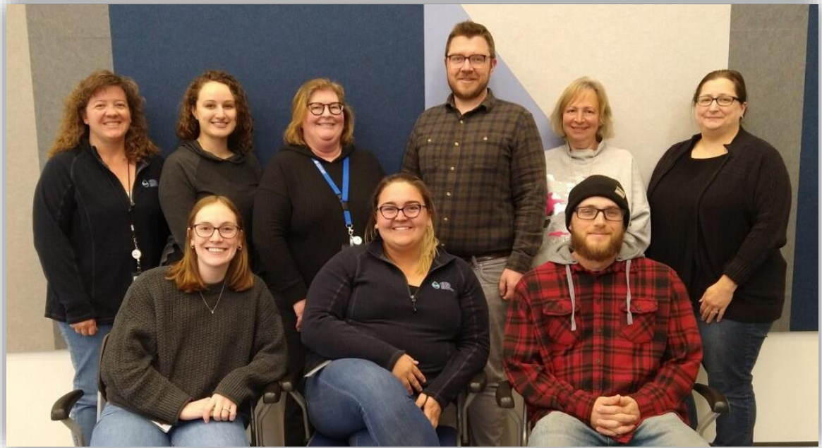
Regulatory Affairs – Compliance Team