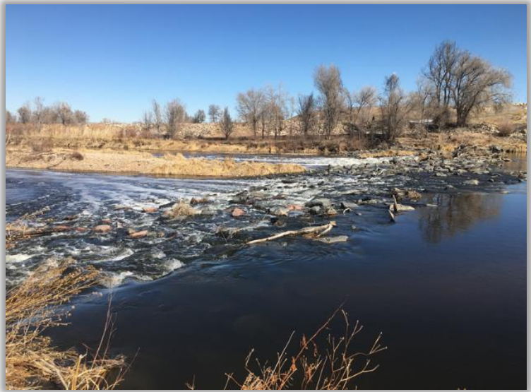
Top: Constructed riffle at South Platte/Clear Creek confluence, part of PAR 1323 project to improve thermal mixing and diversify fish habitat. Below: Repaired grade control structure.

The Metro District has been actively engaging in additional environmentally sustainable efforts specifically targeted at reducing thermal pollution of the effluent. Sewer heat recovery systems can reduce the thermal load of wastewater discharge and reduce energy use in residential areas by providing a sustainable means of heating water and cooling in buildings. The National Western Center (NWC) is currently undergoing major redevelopment and has offered an opportunity to incorporate sewer heat recovery as a sustainable approach to heating and cooling of the development, assisting with the development goal of achieving a net-zero energy landscape.