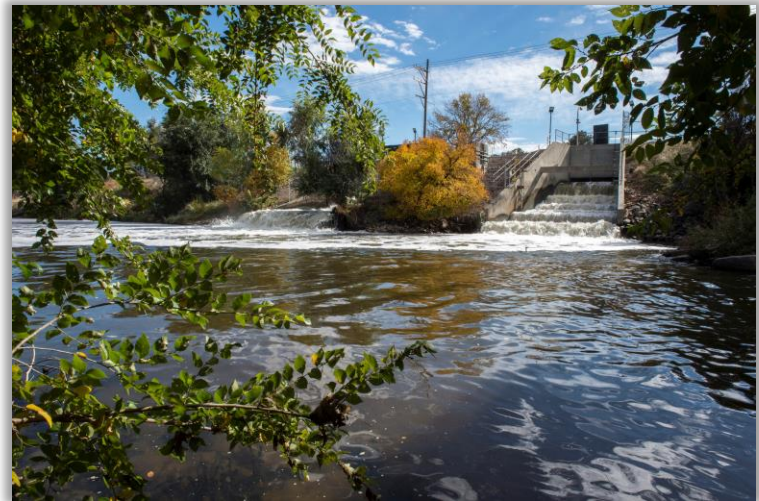
Outfall area at RWHTF, where treated wastewater (effluent) is returned to the South Platte River

The Warm Stream Tier I winter temperature standards assigned to this portion of the South Platte River are based on the presence of the Johnny darter, a small native fish found in shallow water throughout North America east of the Rocky Mountains. The South Platte River basin is on the far western edge of their native range. Metro District fish surveys have demonstrated Johnny darters are not abundant in the mainstem and are more likely to be present in shallow, sandy-bottom tributaries.